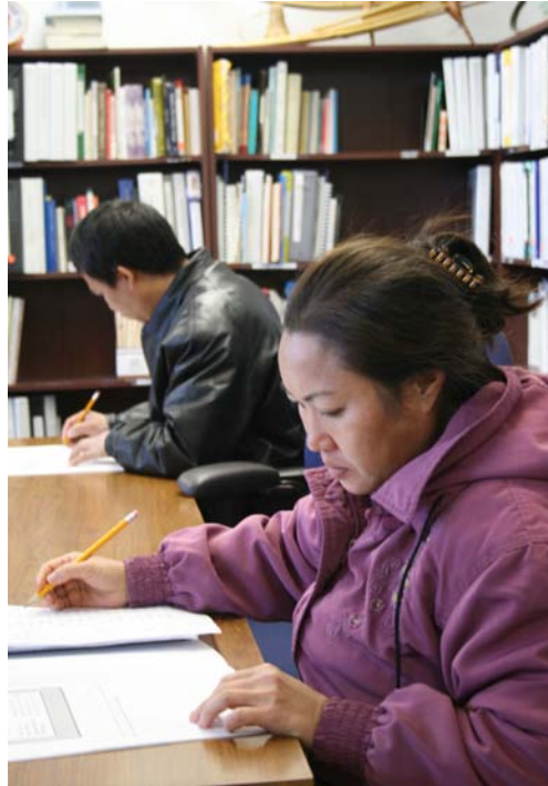
ABE students taking a test