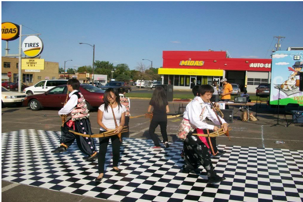
Qeej students performed at the Leap Forward Multicultural Celebration.