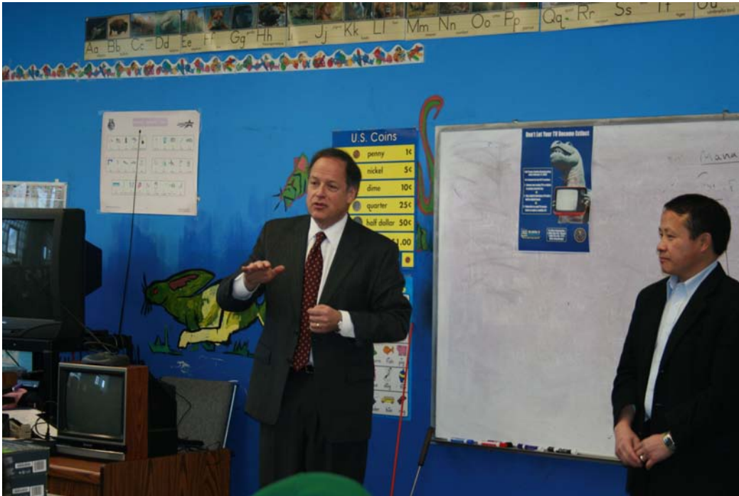
A special guest speaker from the Satellite Radio Superstore presented information on the T.V. Converter Box.