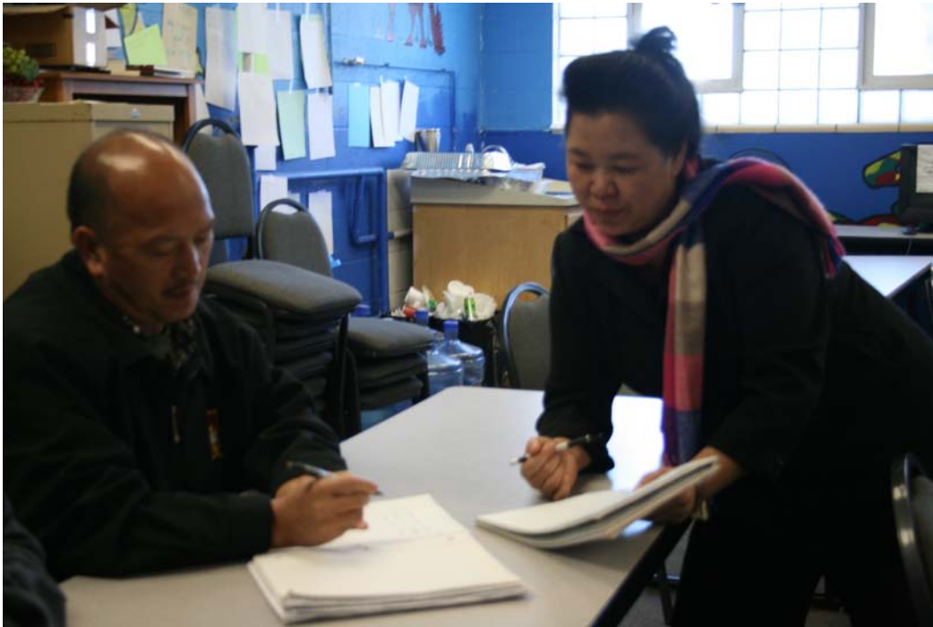
English as a Second Language students study in the morning class.