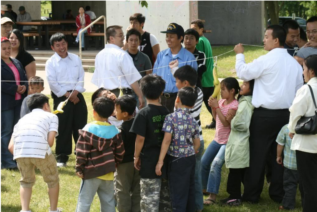
Students participated in a banana eating competition at the HCC picnic.