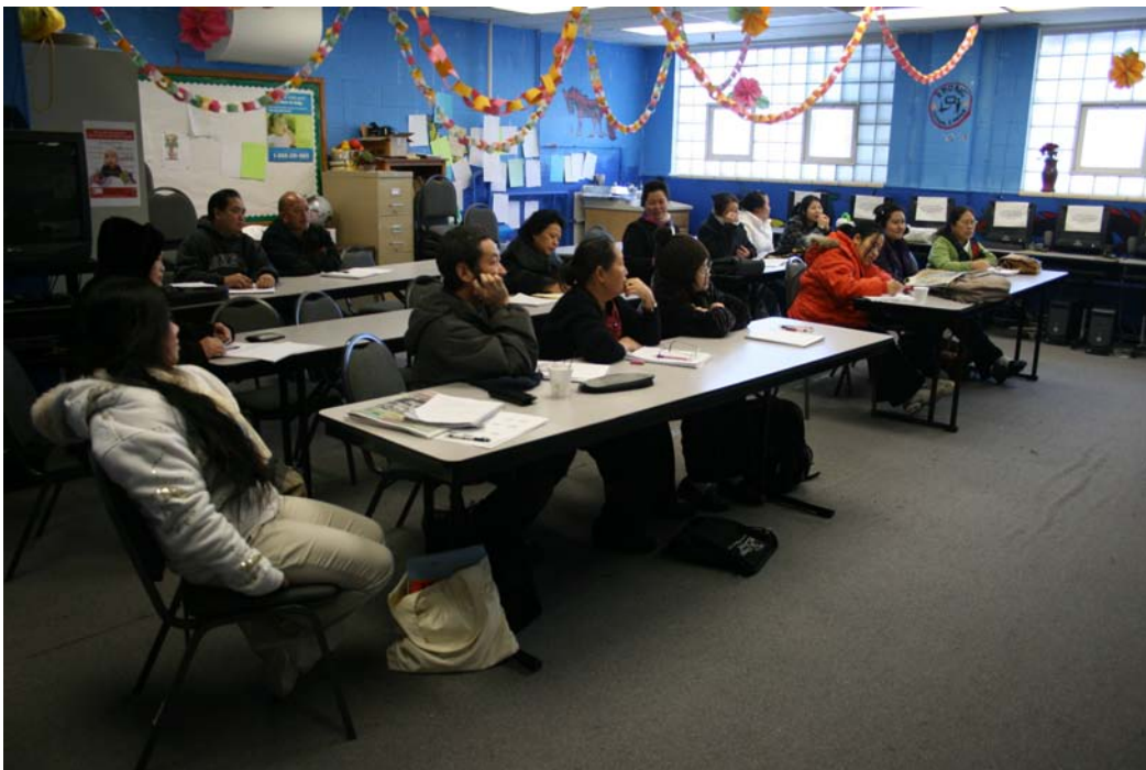
ESL students learning English.