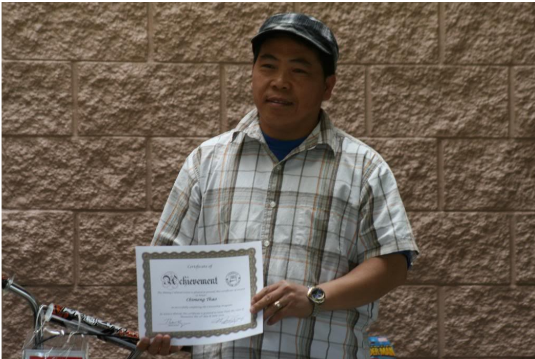
A citizenship student was awarded for his achievement.