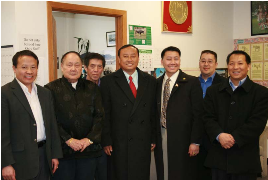
Special guests from Thailand