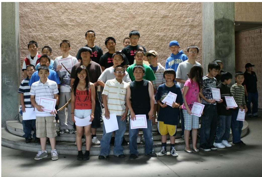
Qeej students honored at the Hmong Cultural Center's 2009 picnic.