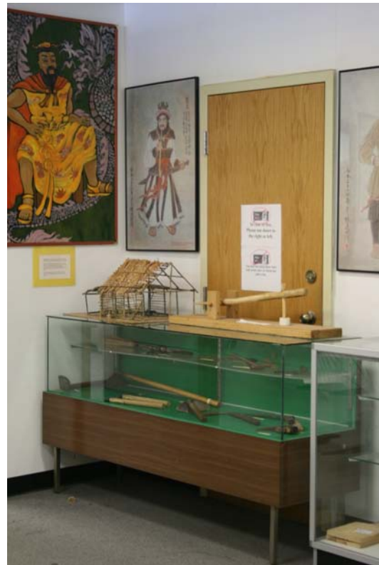
Inside the Hmong Resource Library and Exhibition Room.